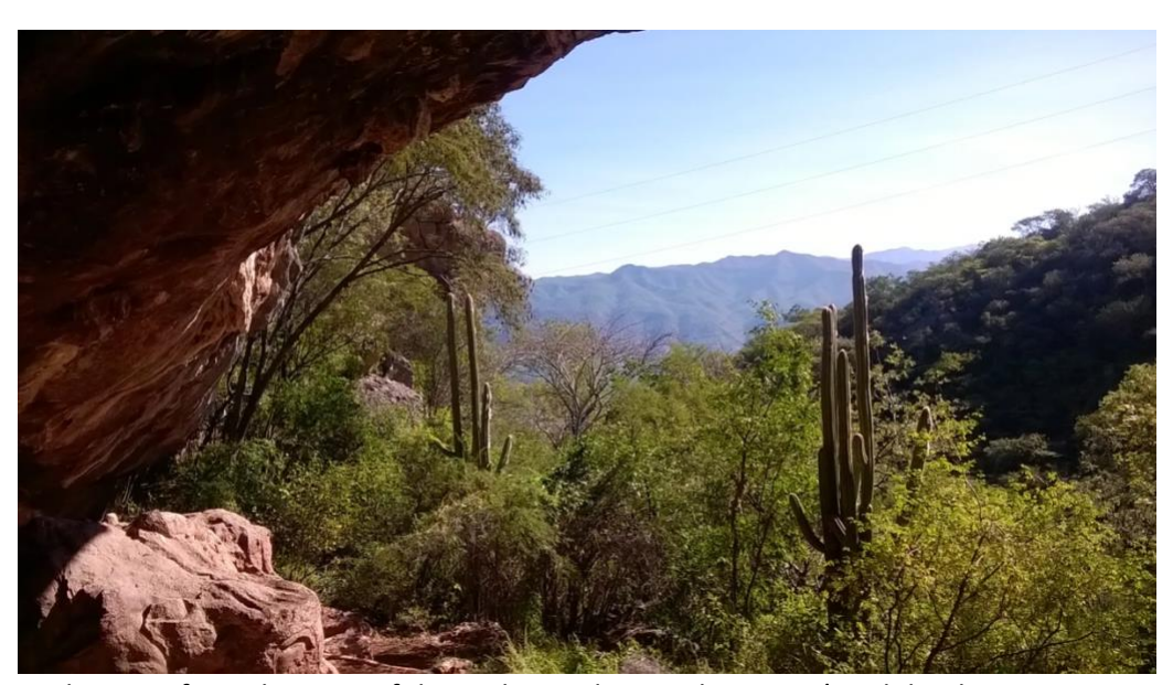
Looking out from the Cave of the Little Hands over the region's rich biodiversity.