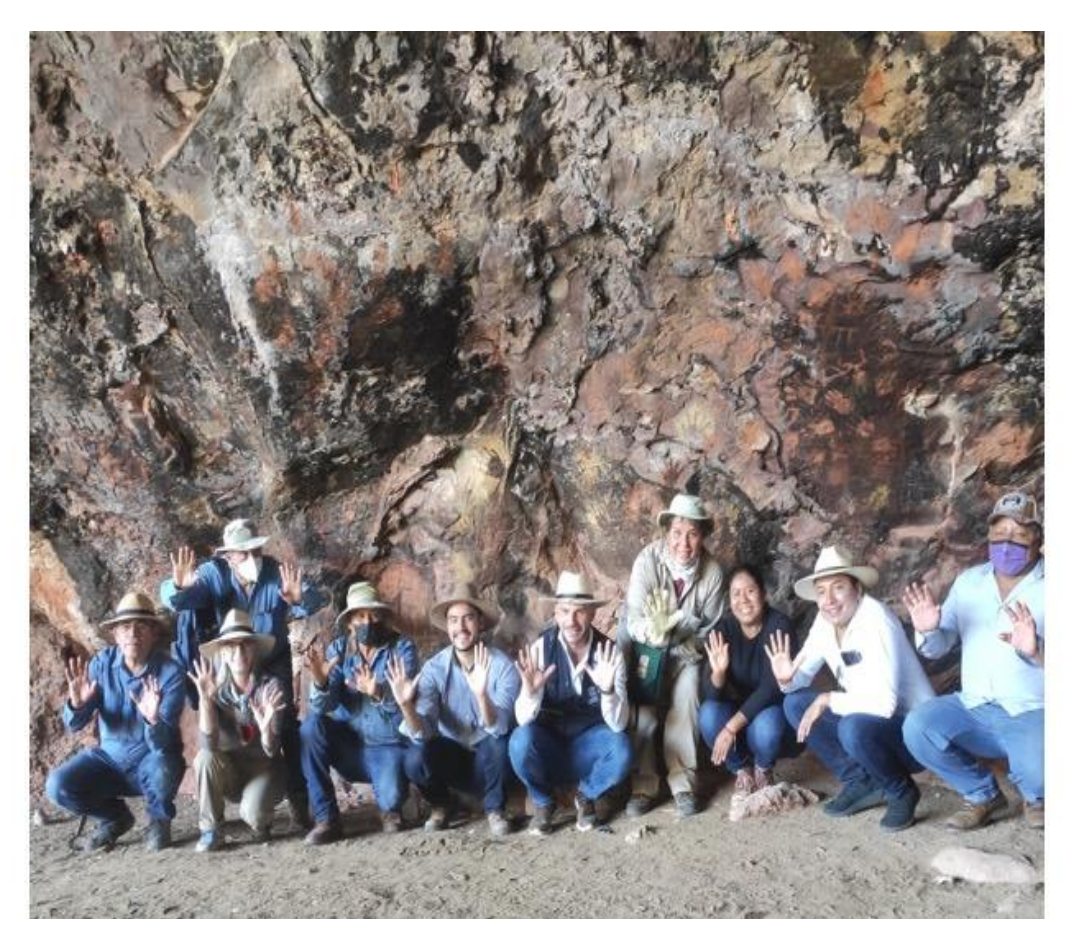
The project team at the Cave of the Little Hands, a key cultural site of the region.