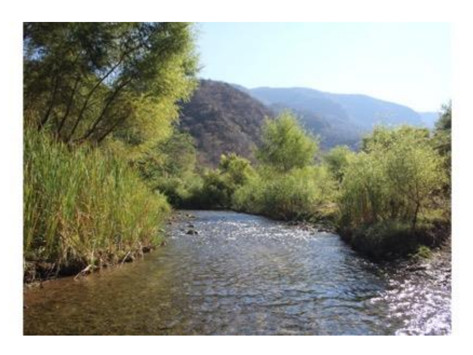
The Rio Grande (Oaxaca) has been the center of the region's cultural development for millennia.